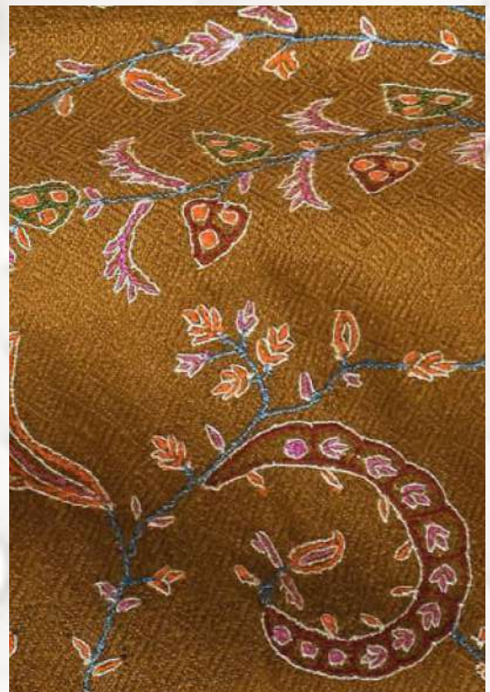
Sozni Embroidery Shawl M.R.P:-7K TO 3L