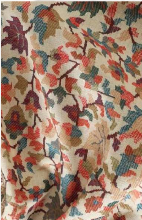
Zari Shimmers Shawl M.R.P:-7K TO 3L