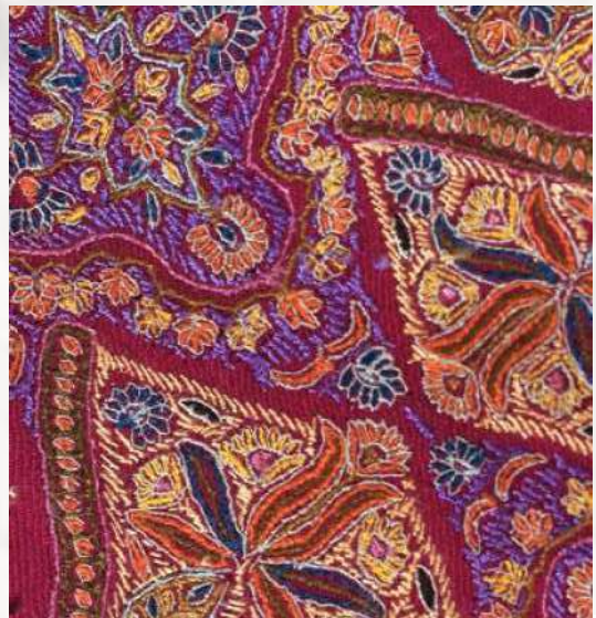
Pure Pashmina M.R.P:- 7K TO 4L