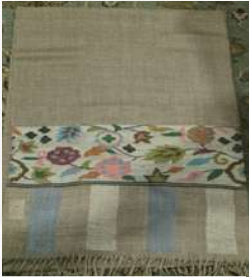
Kani Palla Pashmina M.R.P:-12K TO 15K