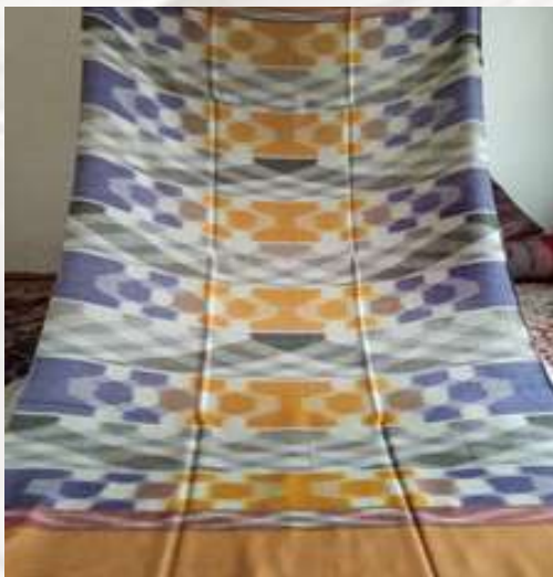
Ikat Weave Shawl M.R.P:-15K TO 20K