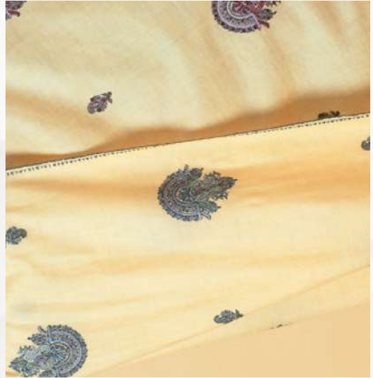
Double Side Aksii Embroidery Shawl M.R.P:-56K TO 2L