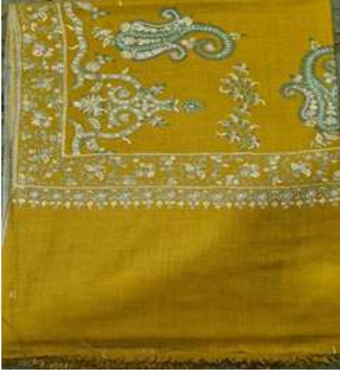
Embroidery shawl M.R.P:-30K TO 40K